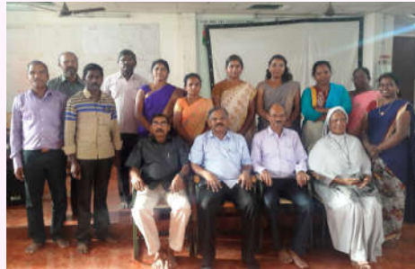
Provision Director's Meeting

they make to our Trust and my heartfelt, sincere thanks to my sponsors who are with me since the Peace Trust is formed. Only with their help we could reach the community and help the needy people.